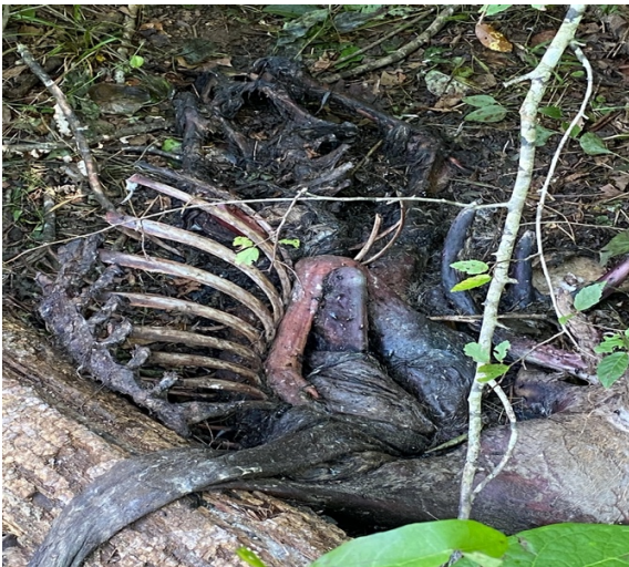
Deer Carcass (body)