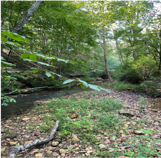
View of Creek Bed

We searched both sides of the creek, creek bed and a game trail that ran along it. We found a "circular" print in the bed itself and a strange print along the game trail. We couldn't properly cast the print in the creek bed because of the water. However, we were able to cast the print on the game trail. This print wasn't well defined, but it did seem to possess "pads" and a strange indentation at the rear. Both prints were documented by photos.