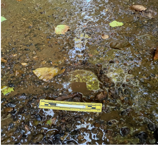
Print in the Creek Bed with Scale