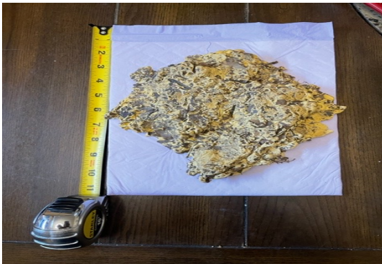
Cast with limited definition