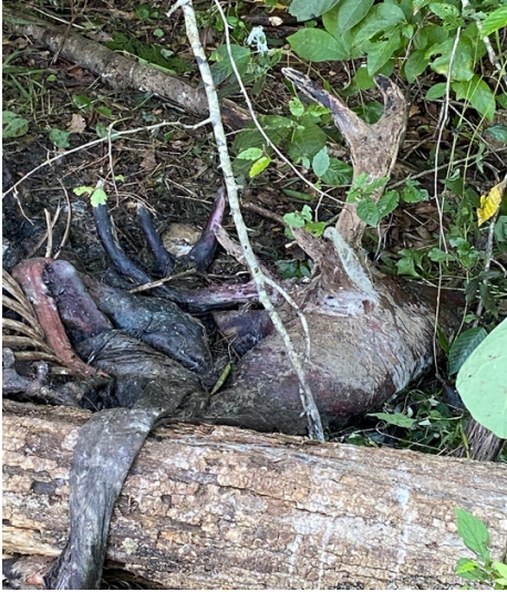
Deer Carcass (head)