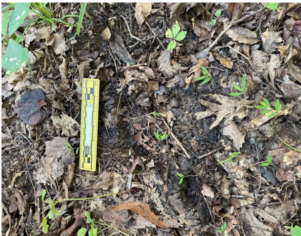
Print on the Game Trail with Scale