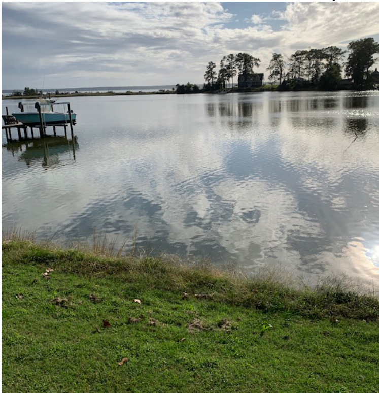
Point Where Animal Entered Creek