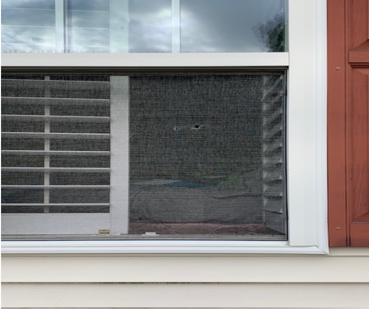
Damaged Window Screen