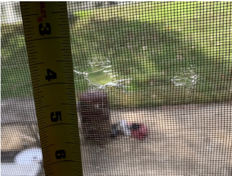
Damaged Screen With Scale