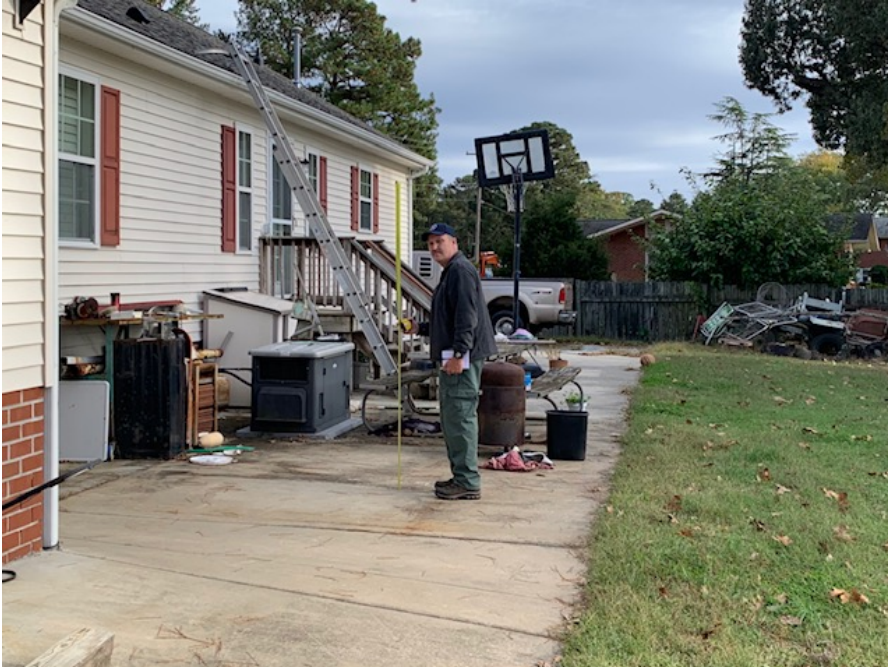
Initial Location of Animal as Observed by Witness